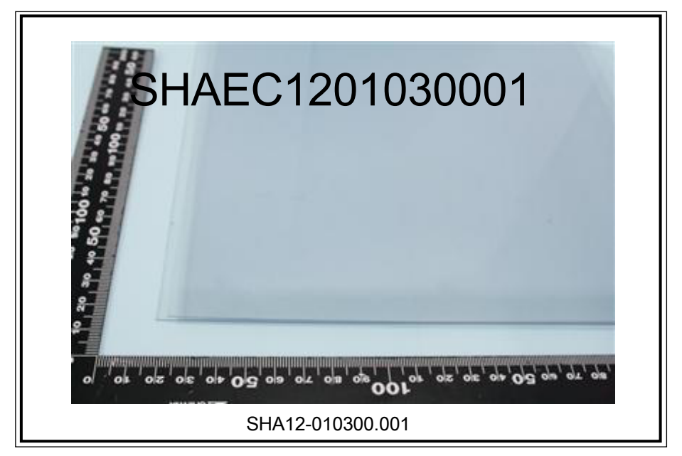
SGS authenticate the photo on original report only